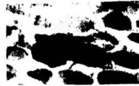
greater wax moth

Almost half of that winds up in landfills(垃圾填埋场), and up to 12 million tons pollute the oceans. So far there is no effective way to get rid of it, but a new study suggests an answer may lie in the stomachs of some hungry worms.